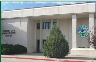
City Administration Building 301 N. 8th

Applications available at www.garden-city.org or call Tanner 620.276.1166